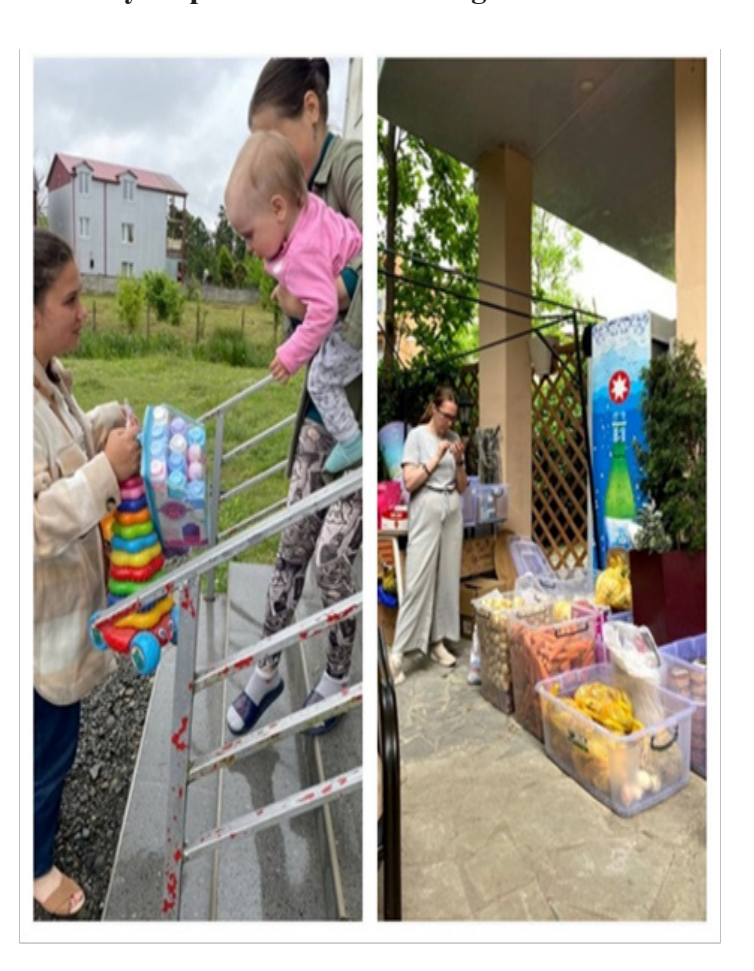
Russian emigrants help Ukrainians in Georgia, "Volunteers Tbilisi", 2022

In the heart of Georgia, Tbilisi, some Russian activists organize charity events, humanitarian aid allocations, and fundraisings for Ukrainian refugees. They mostly operate on Telegram, as the platform is one of the most secure for messaging[18]. For example, initiatives, such as "Volunteers Tbilisi" with an audience of 4 thousand subscribers, helps Ukrainians to settle in Georgia and advise those who have not left Ukraine yet[19]. "Emigration for Action," with an audience of 1 thousand subscribers, posts daily about allocating humanitarian aid to Ukrainians[20]. In addition, activists organize creative and educational spaces for cooperation and gatherings, such as "Frame"[21]. Activists also create online guides for Ukrainians who seek help in Georgia[22]. Russian emigrants also try to communicate with each other. For example, "Relocation and Life in Georgia" posts about the opportunities in the emigrant community and shares interesting places